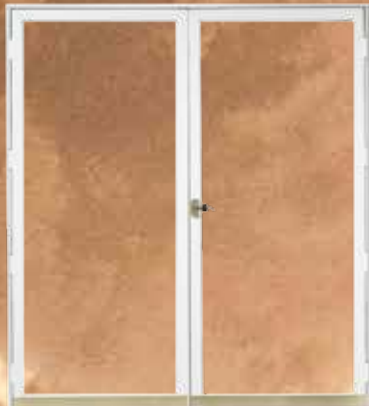
All Door Styles Available in French Door Configuration