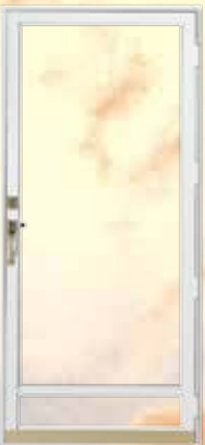
F490 Phoenix I