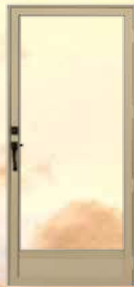
F495 Phoenix II