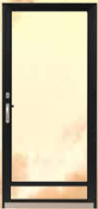
F498 Phoenix III